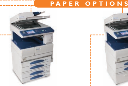
Cassette x 2 (2850CAS2)

(I) 500-sheet paper cassette and small paper cabinet - 1,650 total paper capacity